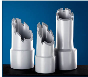
VACUUM TIP CUFFS